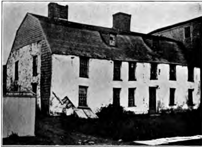
HENRY BULL HOUSE Built 1639-40 NEWPORT, R. I.